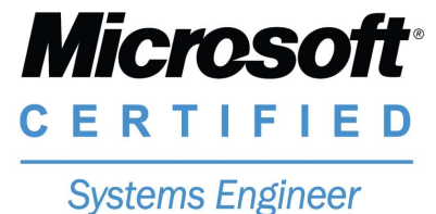
Microsoft Certified Systems Engineer (MCSE)