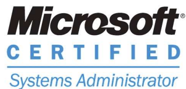
Microsoft Certified Systems Administrator (MCSA)